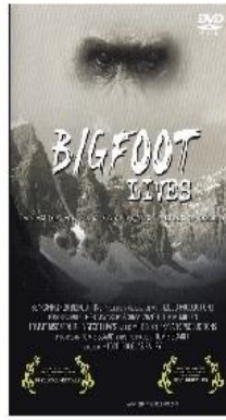
BIGFOOT LIVES See More