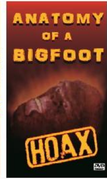
ANATOMY OF A BIGFOOT HOAX See More