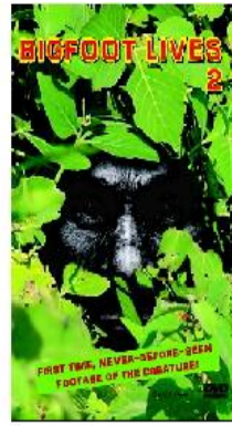
BIGFOOT LIVES 2 See More