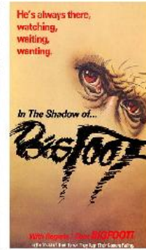
IN THE SHADOW OF BIGFOOT See More